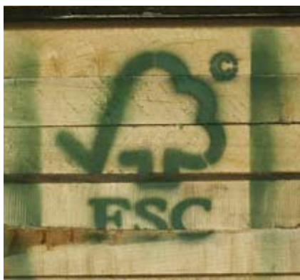
A pallet of timber carries the certification of the Forest Stewardship Council.

Even the FSC encounters obstacles in ensuring integrity. In October 2007, there was a distorted media account of certification abuse by a corporate affiliate of FSC-certified Asia Pulp & Paper (AP&P) that destroyed rainforests in Indonesia and improperly sheltered its bad practices under its association with AP&P, which had certified operations in China. SmartWood reacted promptly with the FSC and The World Wildlife Fund, and took action against AP&P. The FSC published a tighter policy that would prevent the issuance of certificates and the use of the green logo when any affiliate of a certified operation destroys high conservation value forest or conducts logging illegally.